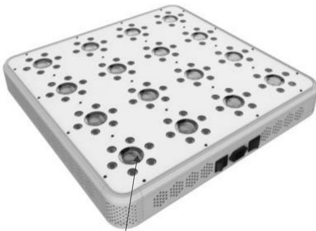
Spectrum Optimized COB LEDs with 105° Lens